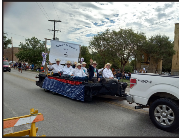
Members of the SRT aboard the SRT Gonzales Chapter 29 float preparing to participate in the "Come and Take It Days" parade. Over 100 entries participated.